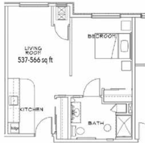
One Bedroom starting at.....$3,900