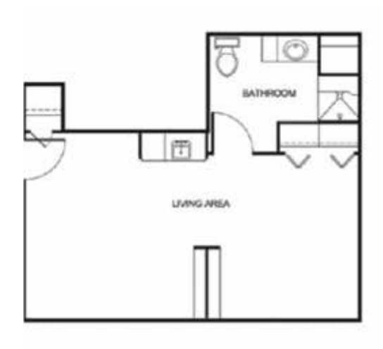
Deluxe Studio starting at ......$3,750