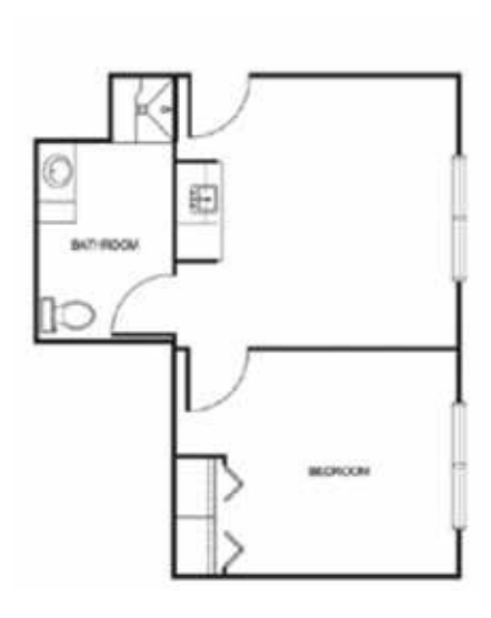
One Bedroom starting at...... $4,100