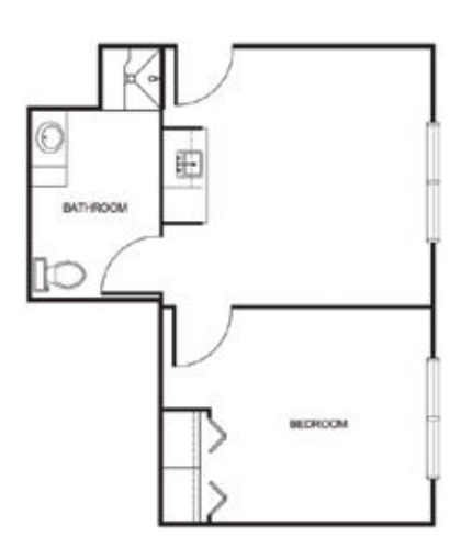
One Bedroom starting at...... $4,100