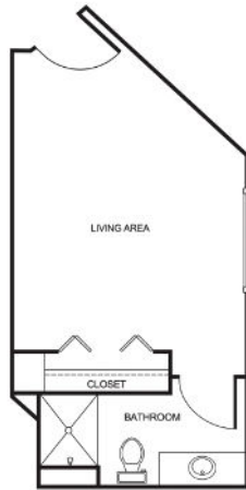
Studio starting at .....$2,925 based on size small, medium or large