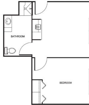
One Bedroom starting at .....$4,325