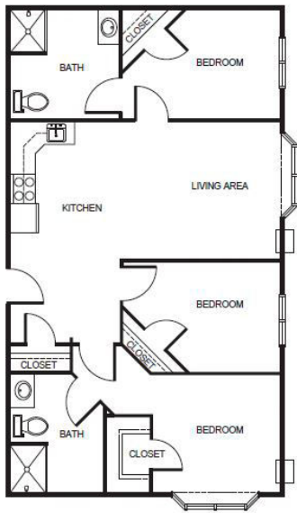
Three Bedroom starting at ..... $5,050