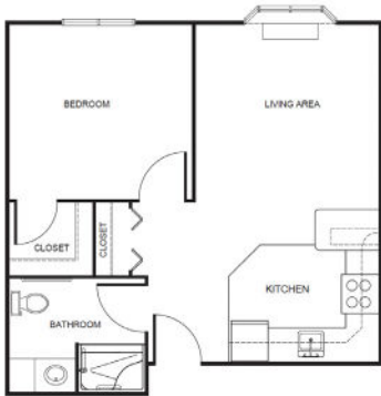
One Bedroom starting at ..... $4,100