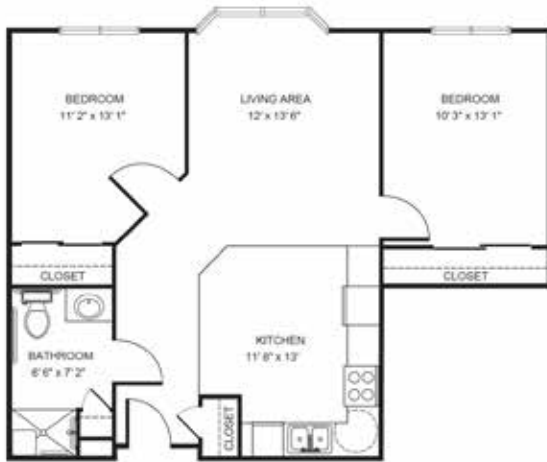
Two Bedroom starting at.....$2,475