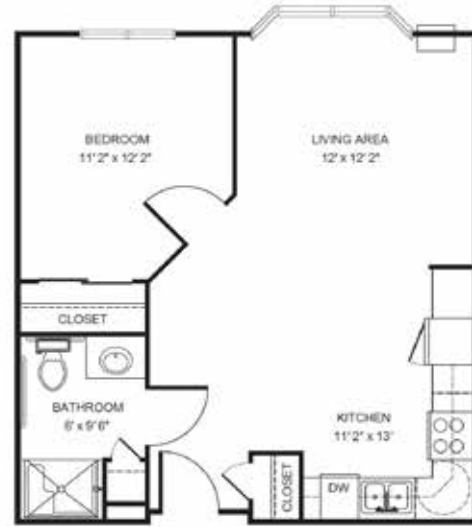
One Bedroom starting at.....$1,950