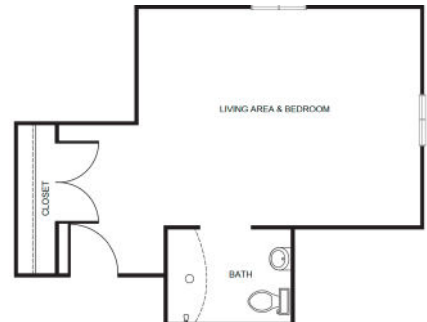
Private Room C starting at ..... $6,500