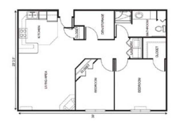
Two Bedroom starting at.....$4,675