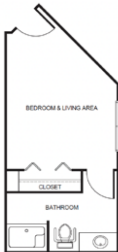
Studio* starting at.....$4,300