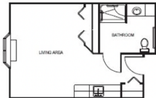
West Studio* starting at.....$4,925