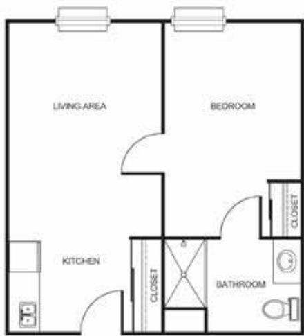
One Bedroom starting at.....$4,325