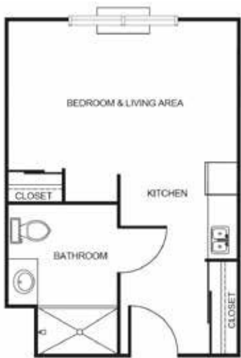
Studio starting at.....$3,700