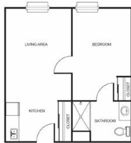
One Bedroom starting at.....$4,325