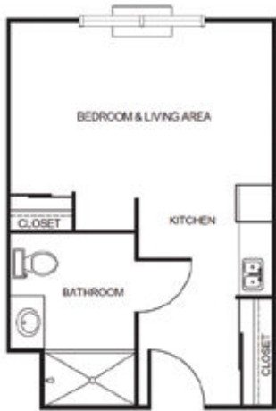
Studio starting at.....$3,900