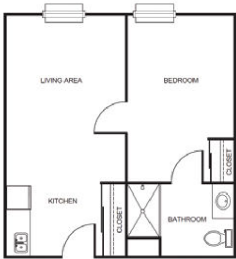
One Bedroom starting at.....$4,550