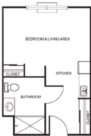
Studio starting at.....$3,900