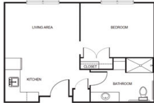
One Bedroom starting at.....$4,850