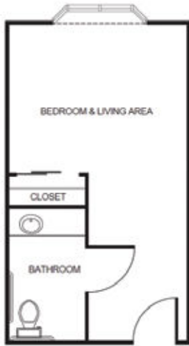
Studio starting at.....$3,450