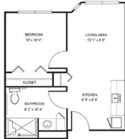
One Bedroom starting at.....$4,200