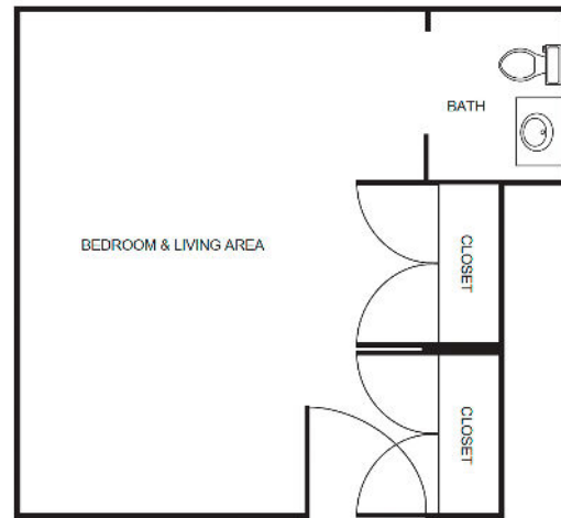
Companion starting at .....$4,950