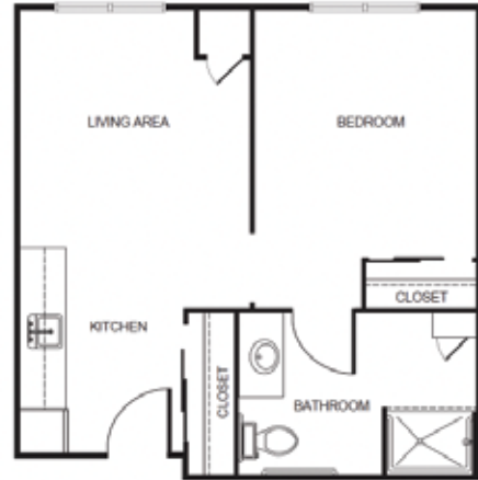
One Bedroom starting at.....$4,050