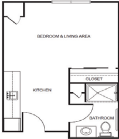
Studio starting at.....$3,350