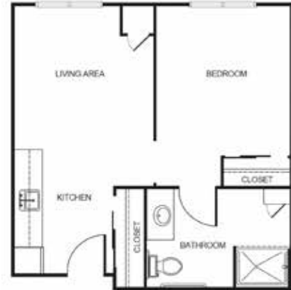
One Bedroom starting at.....$3,825