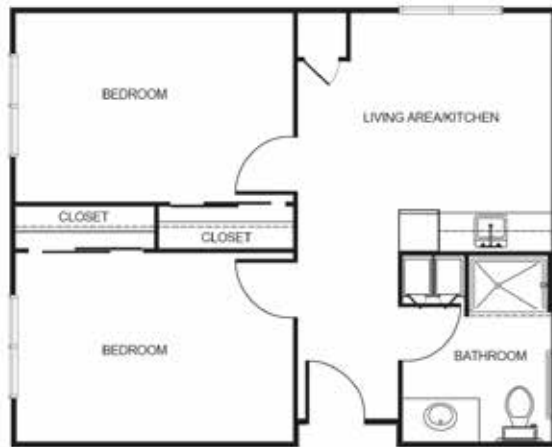
Two Bedroom starting at.....$4,250