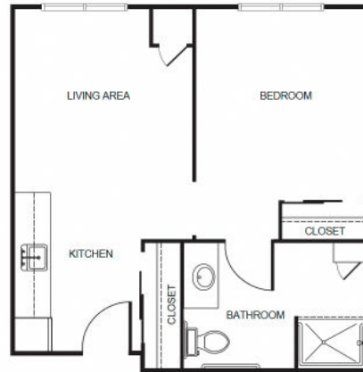
One Bedroom starting at .....$4,250