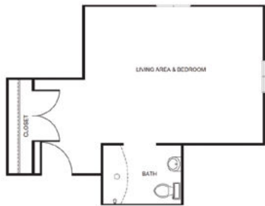
Private Room C starting at ..... $6,175