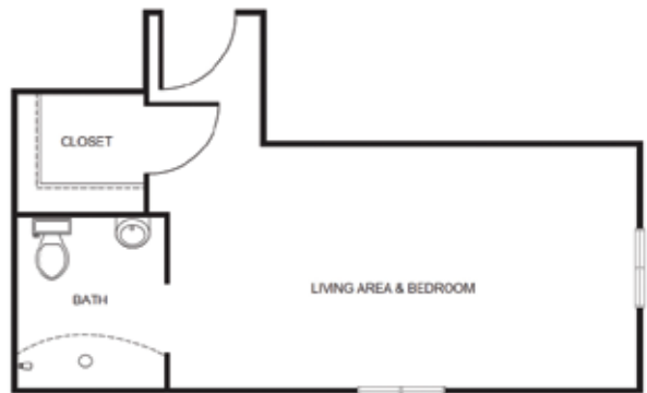
Private Room B starting at ..... $5,975