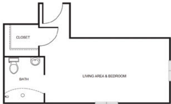
Private Room B starting at ..... $5,975