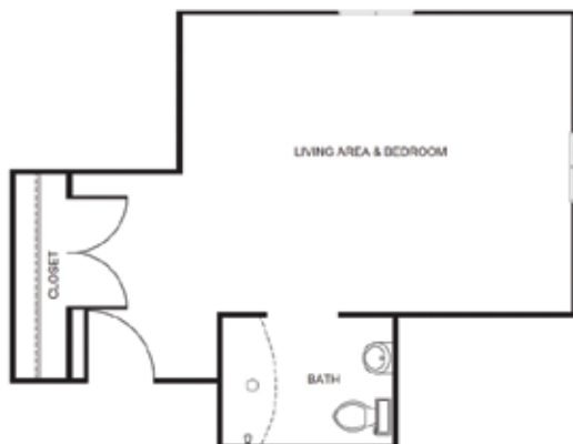
Private Room C starting at ..... $6,175