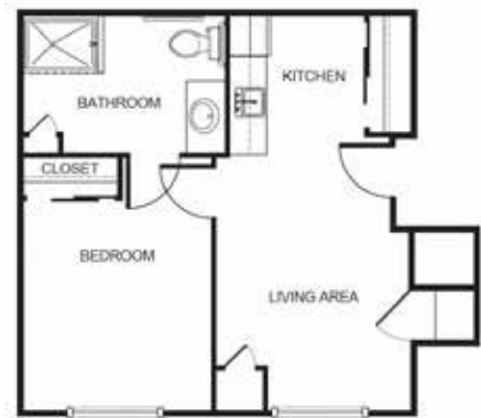
One Bedroom starting at.....$4,700