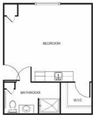
Studio starting at.....$3,250