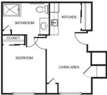
One Bedroom starting at.....$4,950