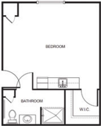
Studio starting at.....$3,425