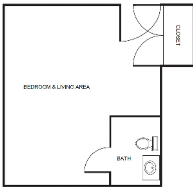
Studio starting at .....$5,500