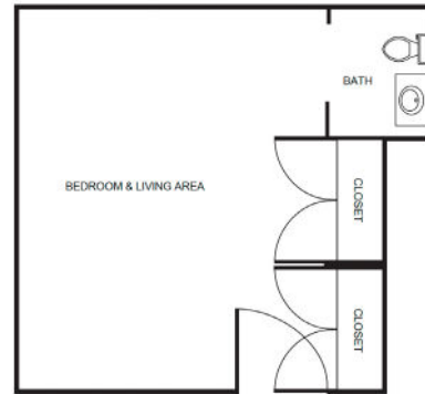
Companion starting at .....$4,600