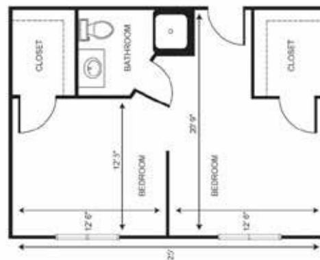
Companion starting at.....$2,800