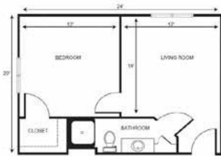
One Bedroom starting at.....$5,100