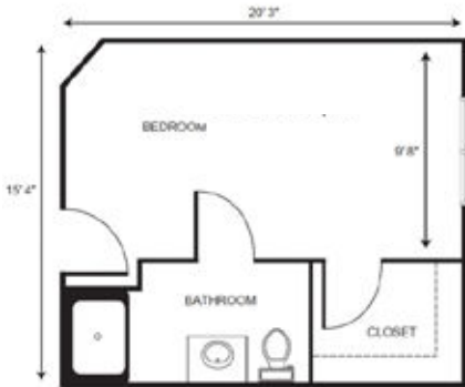
Studio starting at.....$3,100