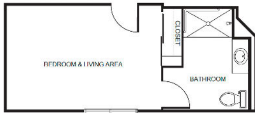
Studio starting at .....$6,900