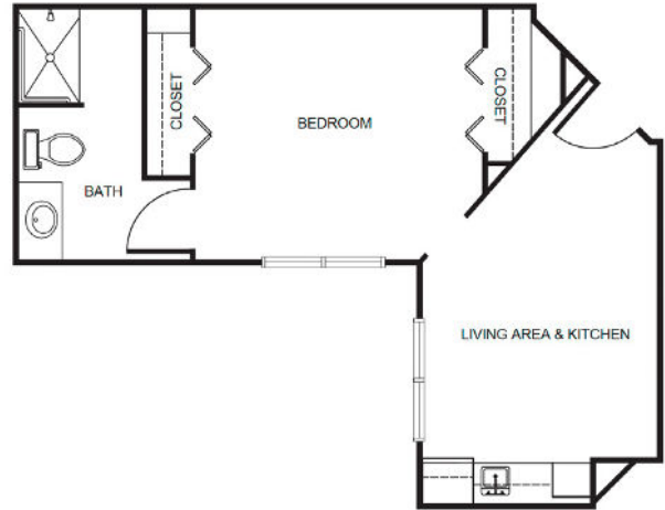
One Bedroom starting at .....$4,800