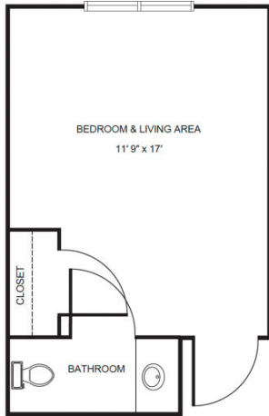
Studio starting at ..... $3,450