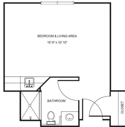
Studio Deluxe starting at ..... $4,350 Large Studio Deluxe starting at ..... $4,550