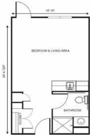
Deluxe Studio starting at .....$3,950