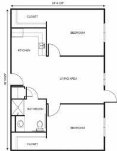
Two Bedroom starting at .....$5,500