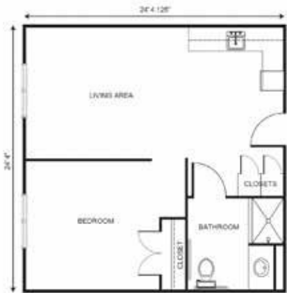
One Bedroom starting at .....$5,050