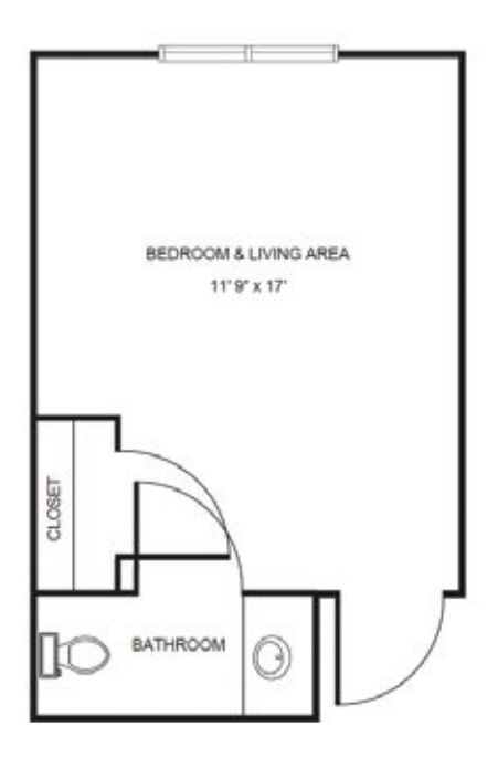
Studio starting at.....$5,475