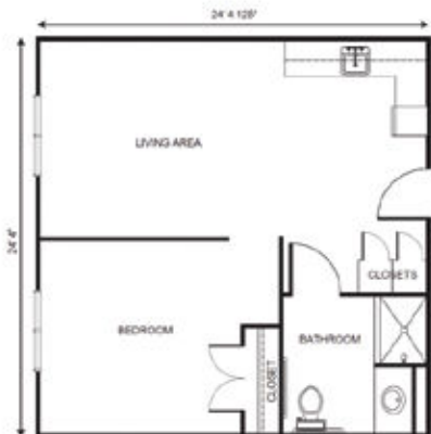
One Bedroom starting at .....$5,275