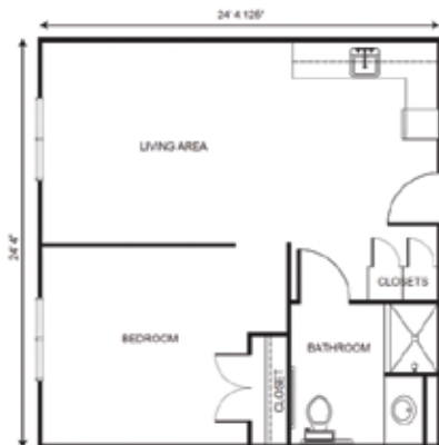
One Bedroom starting at .....$5,275