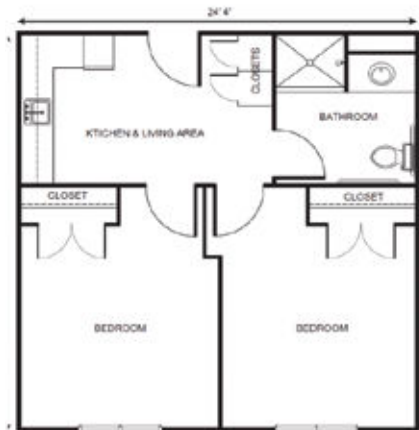
Companion Living starting at .....$3,175