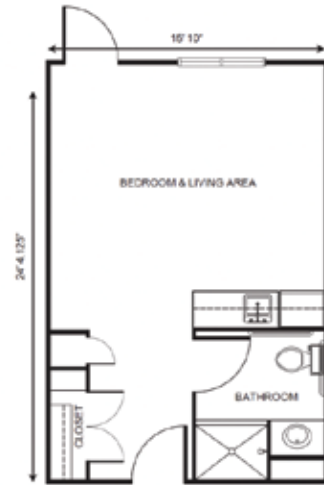
Deluxe Studio starting at .....$4,075