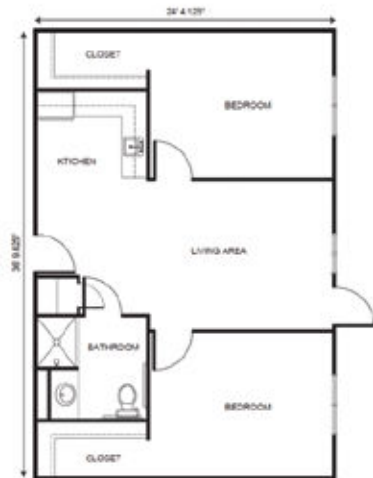
Two Bedroom starting at .....$5,775