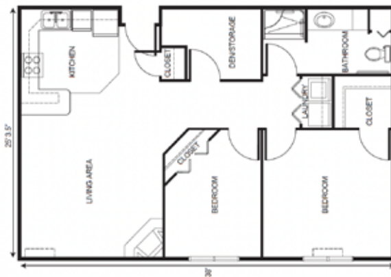
Two Bedroom starting at.....$4,450