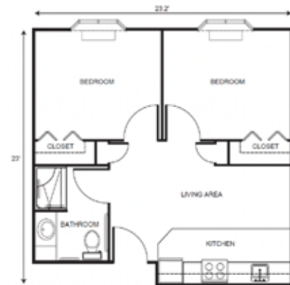
Companion starting at.....$2,475