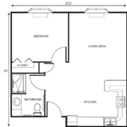
One Bedroom starting at.....$4,125