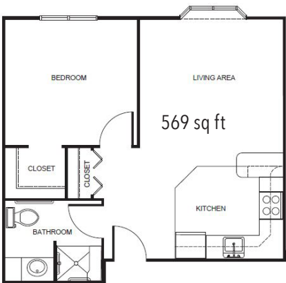
One Bedroom starting at.....$3,050