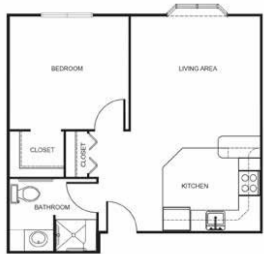
One Bedroom starting at.....$3,625