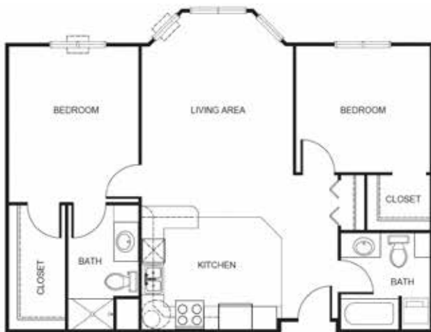
Two Bedroom starting at.....$4,550