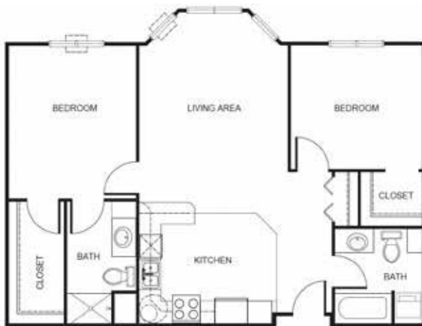
Two Bedroom starting at.....$4,550