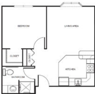
One Bedroom starting at.....$4,250