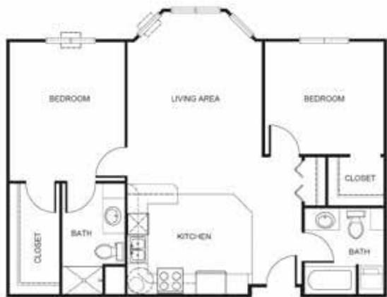
Two Bedroom starting at.....$5,175