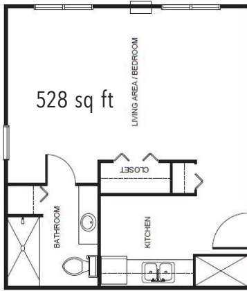
Studio starting at.....$2,400