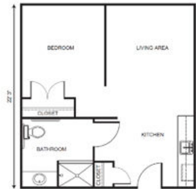
One Bedroom starting at.....$4,900