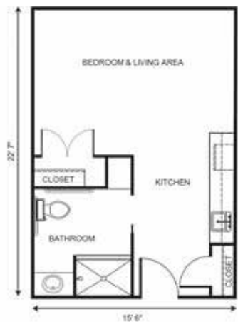
Studio starting at.....$3,900