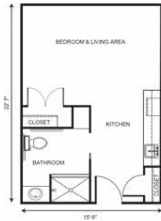
Studio starting at.....$3,900