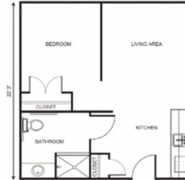
One Bedroom starting at.....$4,900