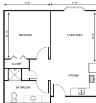
One Bedroom starting at.....$4,550