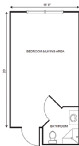
Studio starting at.....$3,550