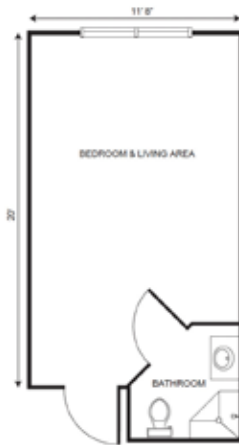
Studio starting at.....$3,350