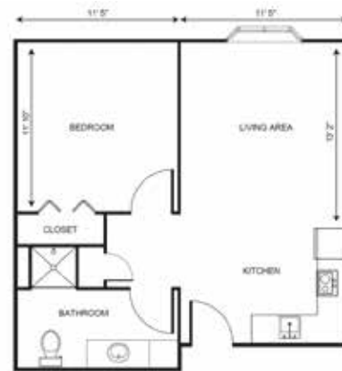
One Bedroom starting at.....$4,300