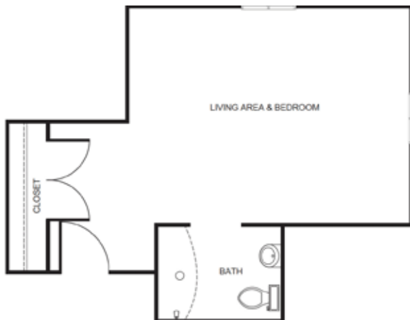
Private Room C starting at ..... $5,875