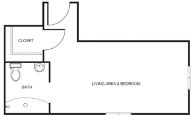
Private Room B starting at ..... $5,675