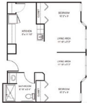
Two Bedroom starting at.....$4,750