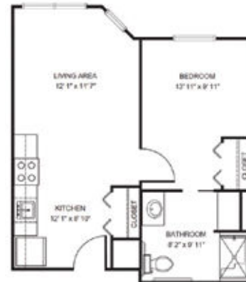
One Bedroom starting at.....$4,250