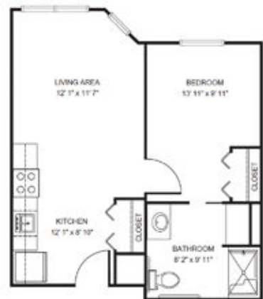
One Bedroom starting at.....$3,800