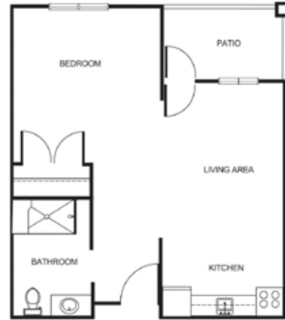
Alcove with Patio starting at.....$3,200