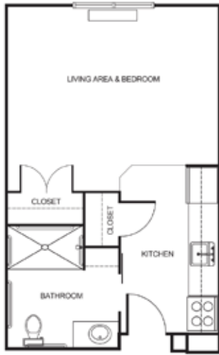
Studio starting at.....$2,700