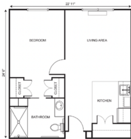
One Bedroom starting at.....$3,300