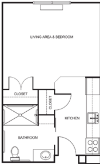
Studio starting at.....$3,000