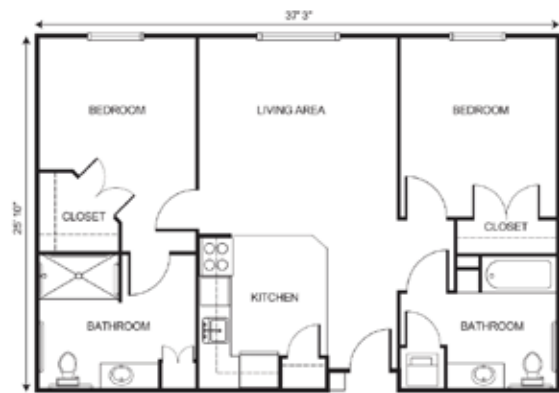
Two Bedroom starting at.....$4,300