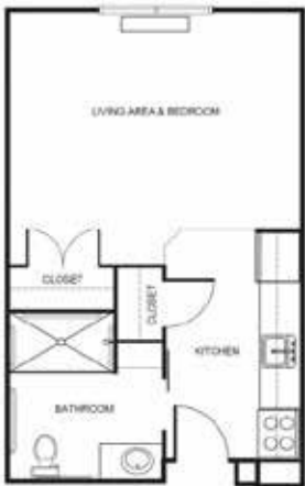
Studio starting at.....$2,875