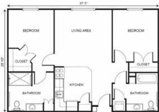
Two Bedroom starting at.....$4,375