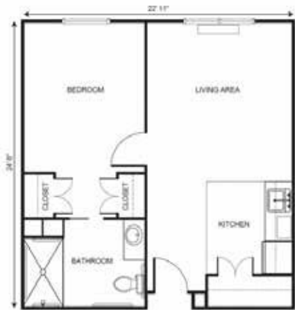
One Bedroom starting at.....$3,675