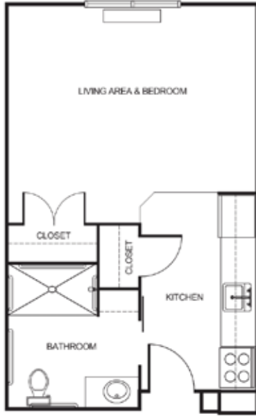
Studio starting at.....$3,500