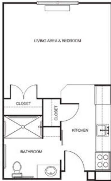
Studio starting at.....$3,500