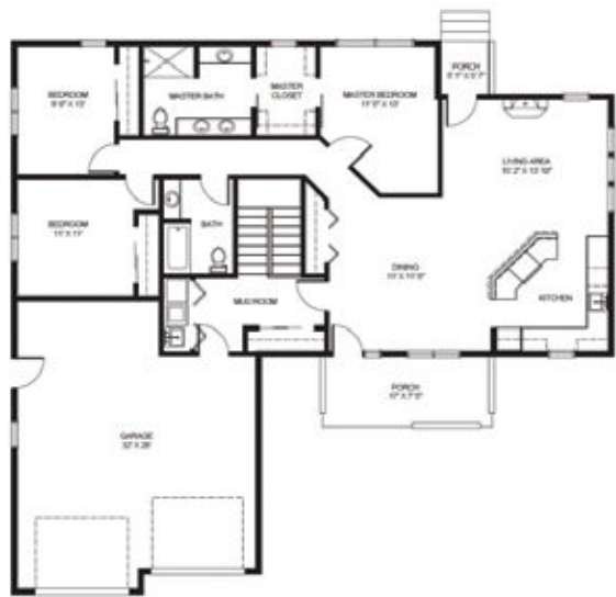
Three Bedroom Cottage starting at .....$3,825