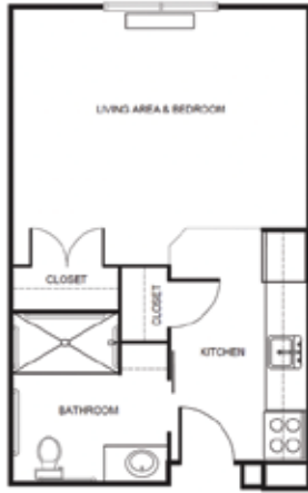
Studio starting at.....$2,625