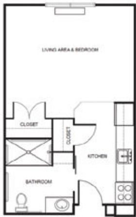
Studio starting at.....$2,625