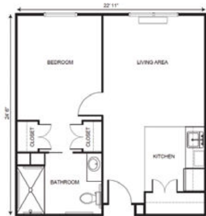
One Bedroom starting at.....$3,175