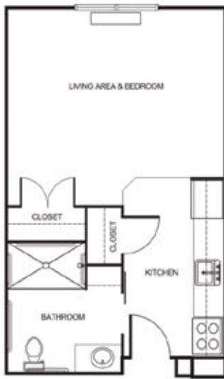
Studio starting at.....$3,075