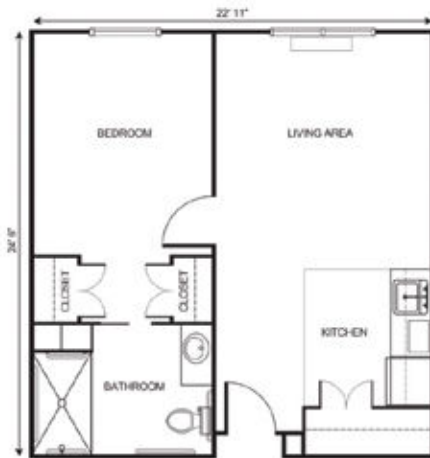
One Bedroom starting at.....$3,825