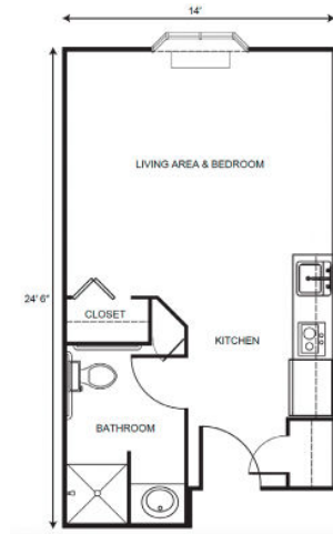
Large Studio starting at .....$3,425