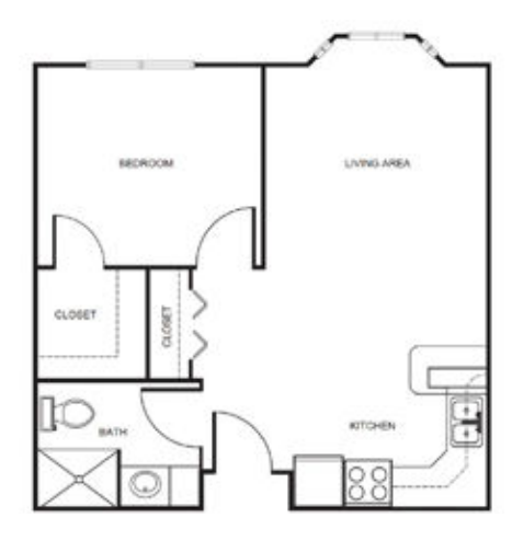
One Bedroom starting at.....$3,825