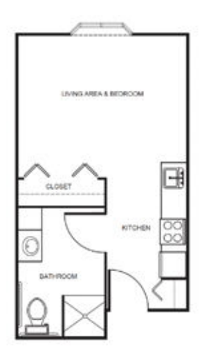
Studio starting at.....$3,625