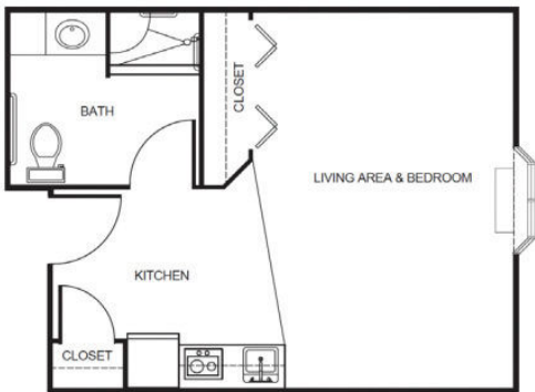
Studio starting at..... $2,625